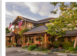
Cambria Pines Lodge

Located in Cambria, "one of America's prettiest towns" according to forbes.com. Take time to stroll through their extensive grounds and gardens which have been featured in such publications as Sunset Magazine, including the organic kitchen garden, butterfly garden, rose garden, and many others.